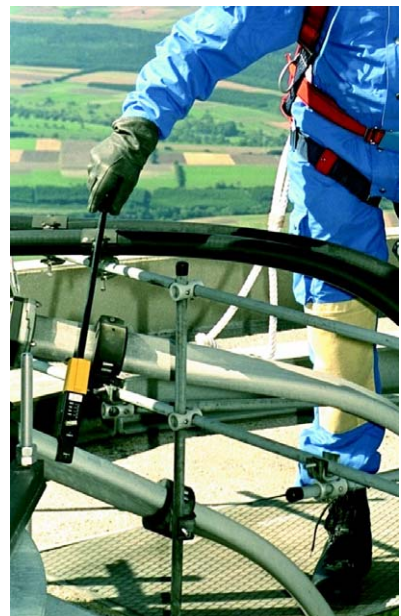
RadMan XT used as an instrument for leak detection