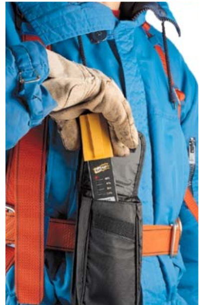
RadMan XT used as a personal monitor for radio frequency fields

As a locating unit all RadMan and RadMan XT versions can be used to locate leaks on waveguides and coaxial screw connectors (picture on the right). A non-conductive extension with handle is available as an optional accessory.