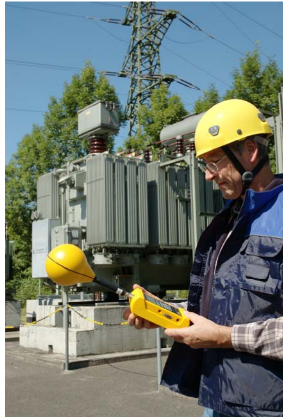
Measuring electromagnetic field exposure at a transformer substation

Zone 1 covers all workplaces where the occupational safety exposure limit values apply. For this reason, Zone 1 should not otherwise be accessible to the general public.