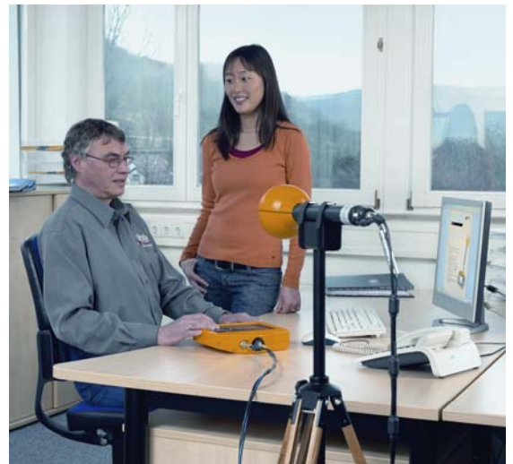
Measuring electromagnetic field exposure at an office workstation

This article has also been published in PRZEGLĄD ELEKTROTECHNICZNY (Electrical Review), R. 85 NR 6/2009