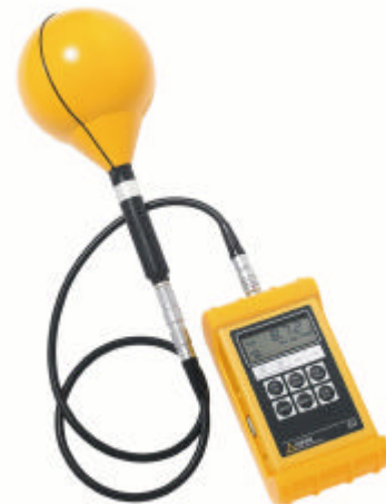
Fig. 3: The Exposure Level Tester ELT-400 from Narda Safety Test Solutions precisely implements the Time Domain Evaluation method laid down in EN 50366, and displays the result immediately.

A low measurement uncertainty is therefore in the interests of end users, who are looking for safety. It is also in the manufacturer's interests, to be able to claim honestly that an appliance is not only "good", but that it is also CE compliant.