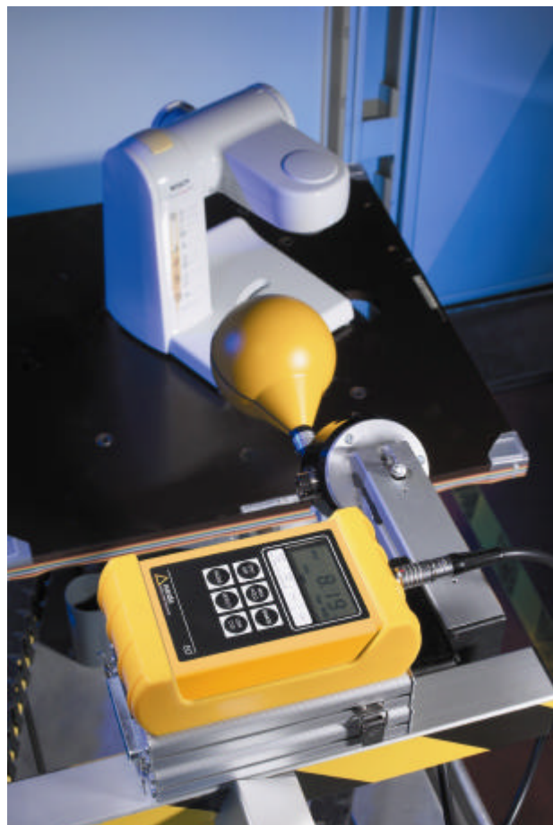
Fig. 1: Testing a domestic appliance at the specified distance. The probe contains three mutually perpendicular coils with a cross sectional area of 100 cm 2 as prescribed in EN 50366.

Is this purely a European affair? No, indeed. Compliance with EN 50366 is mandatory since February 2004 for the award of the CE mark. This means that all manufacturers outside the EU must also perform the tests prescribed by EN30566 if they want their products to be imported into the EU area. This involves some expense, which can only be kept to a reasonable level by the use of practical test equipment. On the other hand, clients outside the EU will also benefit from this tried and tested safety – a bonus for manufacturers, importers and retailers.