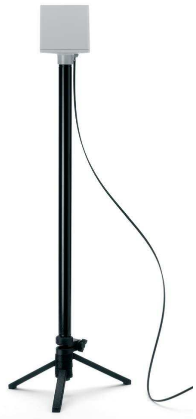
EHP-200 Isotropic E-H Field Analyzer installed on RF-transparent tripod and with optical cable connection

However, for the ionized regions are originated by the solar activity they're subjected to daily and seasonal changes from nearly total to no reflection at all; the reflection characteristics are also deeply changing in relation with the operating frequency. The broadcasters must therefore adopt such technical solutions aimed to ensure permanent service, like transmitting in different frequency bands during the day.